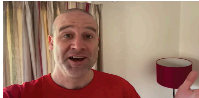
Matt Parker Addresses Our Society

M att Parker, is an Australian-born author, comedian and Mathematician, best known for talking about the funny side of numbers, most famously in his bestseller Humble Pi . He also produced a beautiful introductory video for the Maths Society, where he gave us an interesting conundrum to solve, which is featured in this biography. He has done a great deal to popularise maths, as a former maths teacher, through YouTube videos, tours, and writing the first maths book to ever become a No. 1 Sunday Times bestseller. He now lives in the English town of Godalming in Surrey, working in the UK.